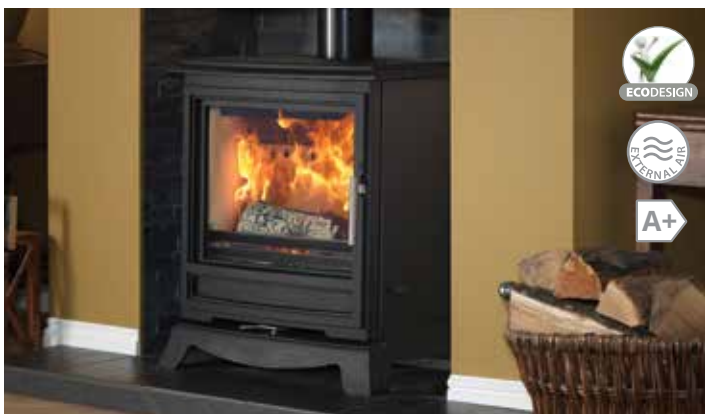
CPV5W Classic Slimline Stove

Available standard or wide, square or curved door, logstore and canopy option