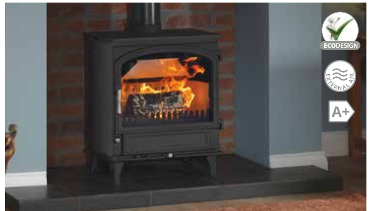
HPV5W Heritage Curved Door Stove

Also available in 5kW. Available freestanding with logstore, wall mounted, leg stand or pedestal stand