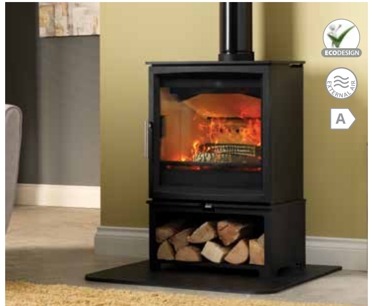
Woodtec 5W Deep Stove on Logstore

Also available with low leg stand or freestanding