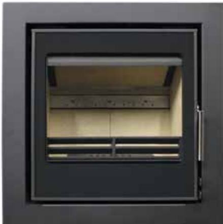
Steel Frame - Chrome Handle