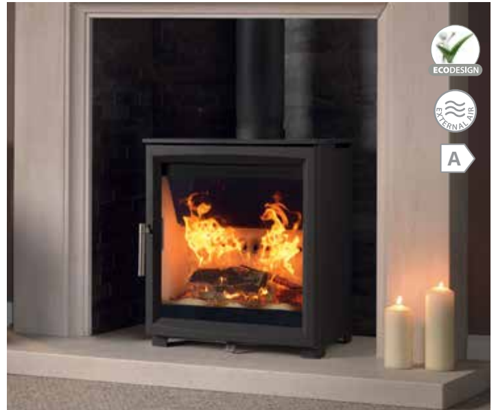
Woodtec 5 Wide Stove

Also available with logstore or freestanding