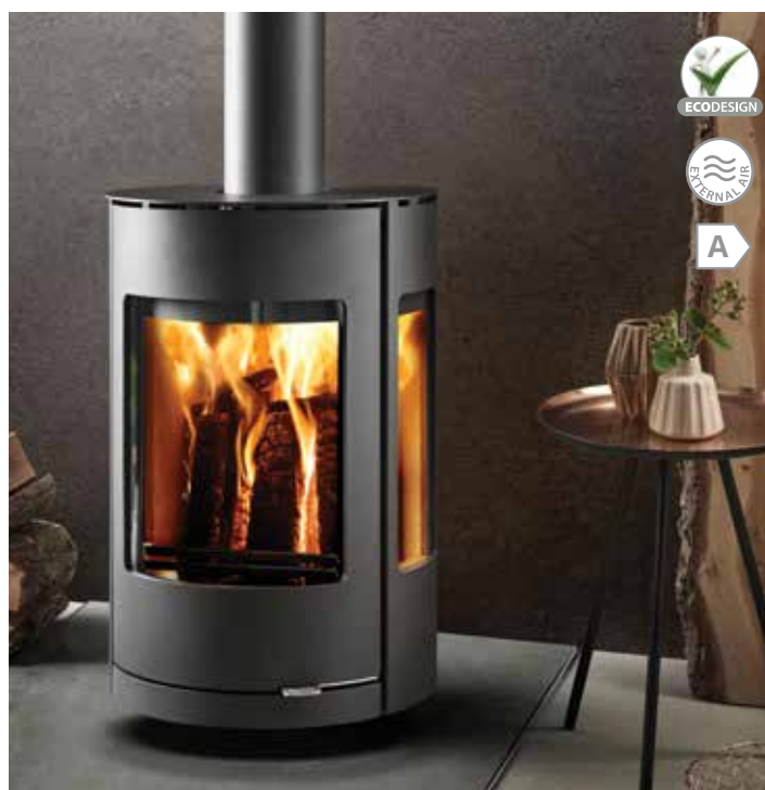
Uniq 37 Compact