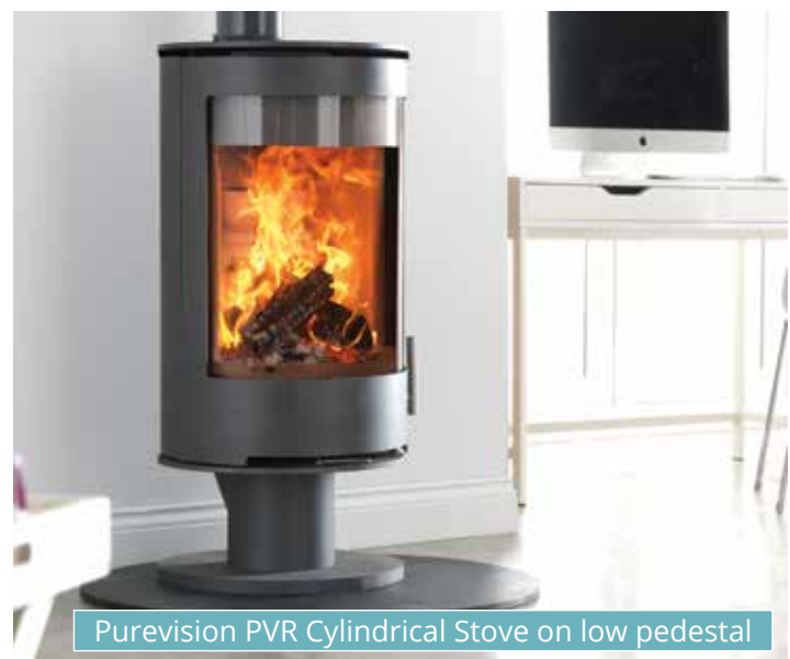
Purevision PVR Cylindrical Stove on low pedestal

Output 5kW Efficiency 82.5% Fuel Multifuel Flue 127mm Weight 130Kg Size mm 720H x 610W x 410D