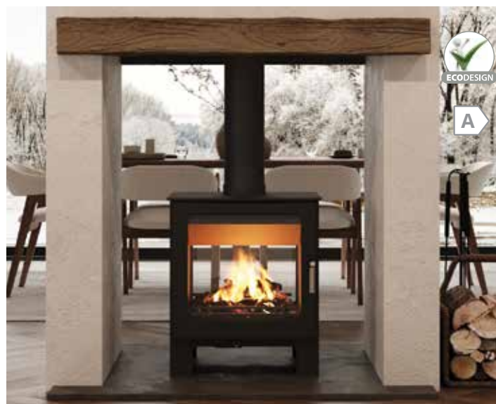
Woodland Double Sided