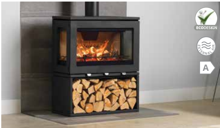
Purevision LPV8 Stove with logstore

Also available in 5W and Slimline, pedestal and logstore options