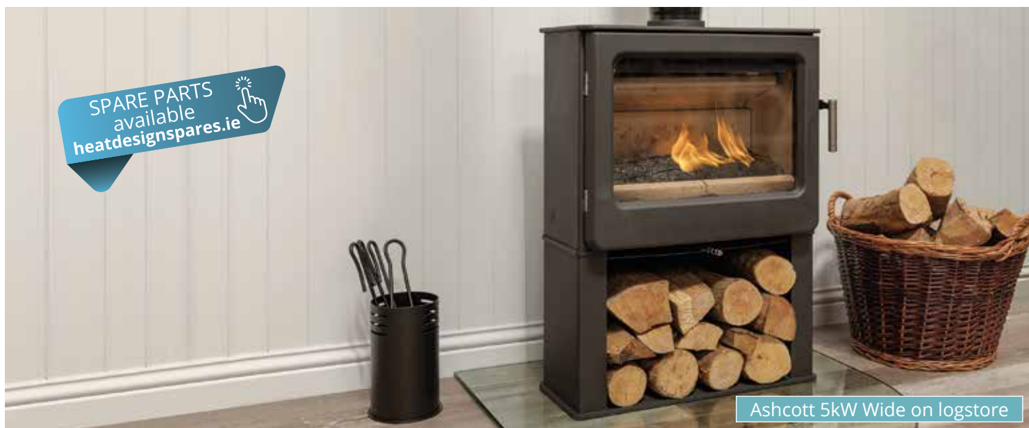
Ashcott 5kW Wide on logstore

*Wood moisture content should be below 20% for optimum burning.