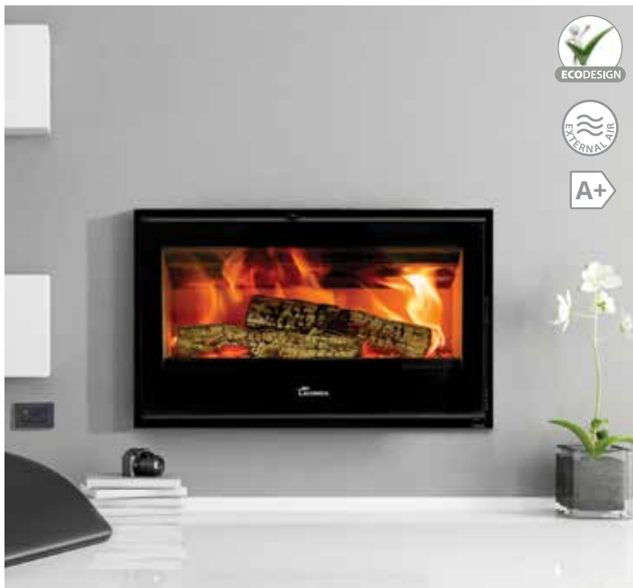
Gold Plus 800