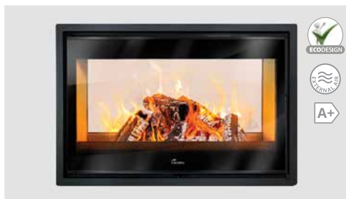
Nickel 1000 Double Sided