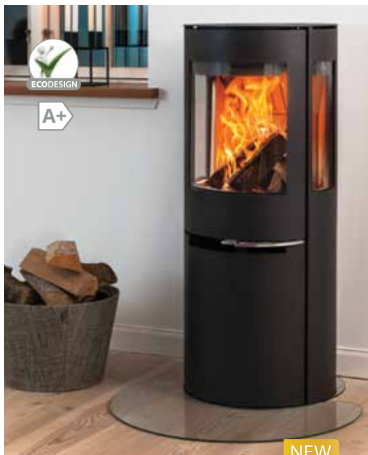
Aduro H1 Hybrid Stove

Output 6kW Efficiency 80% Fuel Wood* Flue 150mm Weight 103Kg Size mm 1040H x 500W x 490D