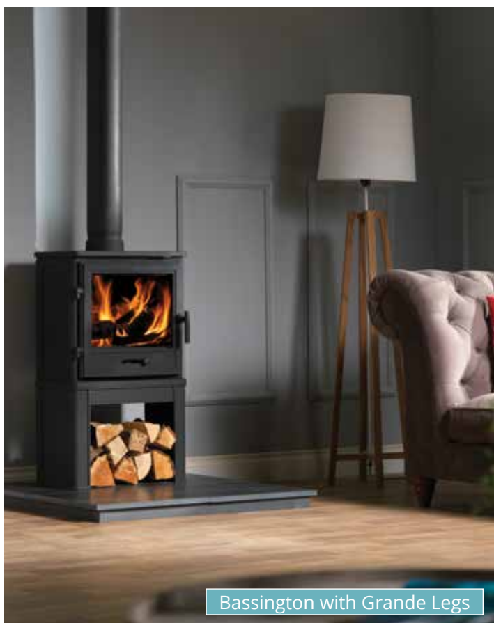
Bassington with Grande Legs