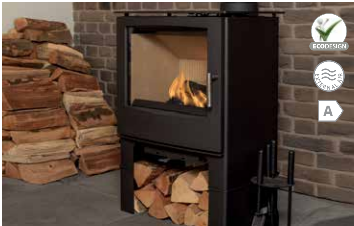
Woodland Large Logstore