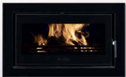
Vitae 8kW Landscape Cassette