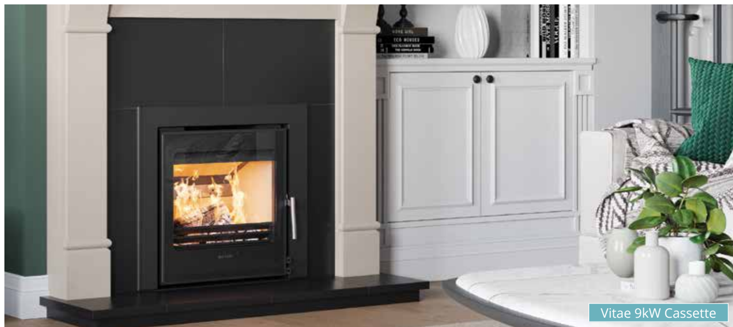
Vitae 9kW Cassette