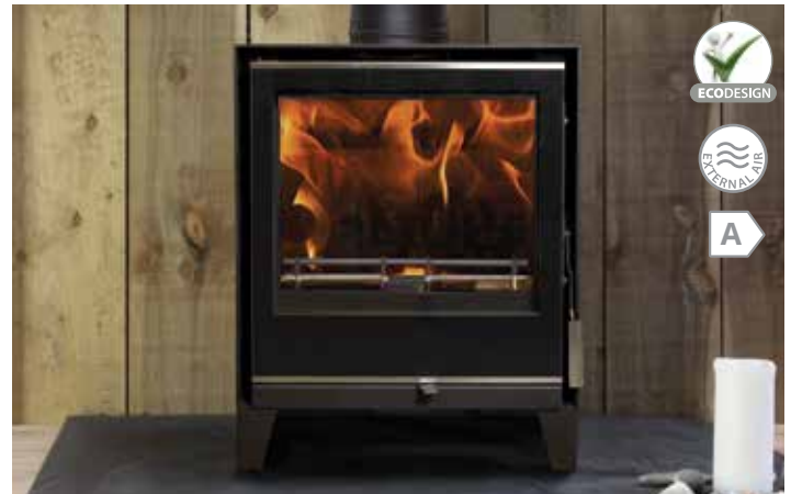
Christon 550 with legs