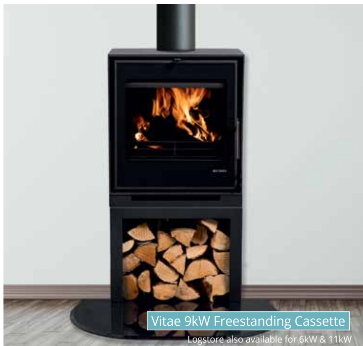
Vitae 9kW Freestanding Cassette