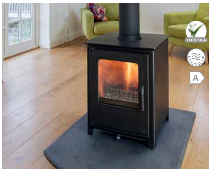
Loxton 8kW Double Sided