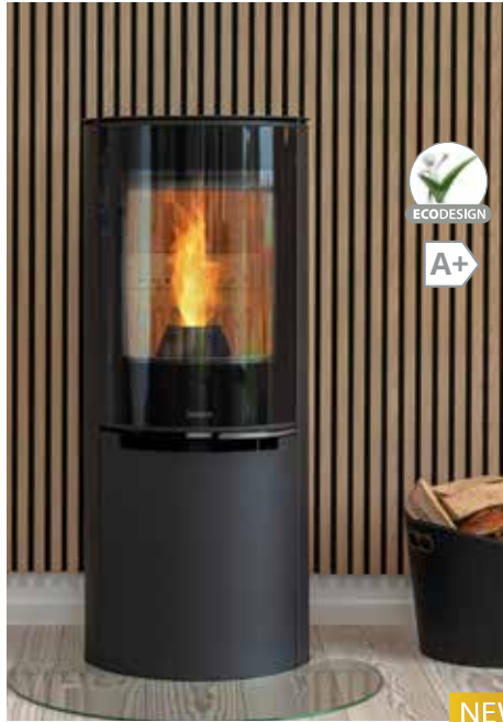
Aduro H4 Lux Hybrid Stove

Output 6kW Efficiency up to 80% Fuel Wood* Flue 150mm (top & rear) Weight 93Kg Size mm 958H x 500W x 447D