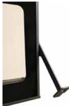
Vitae Hidden Handle