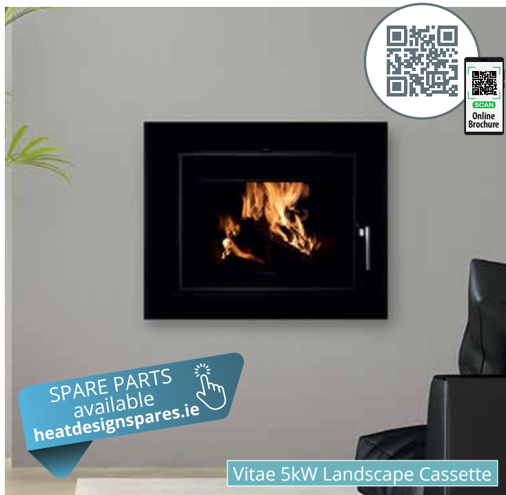
Vitae 5kW Landscape Cassette

SPARE PARTS available heatdesignspares.ie