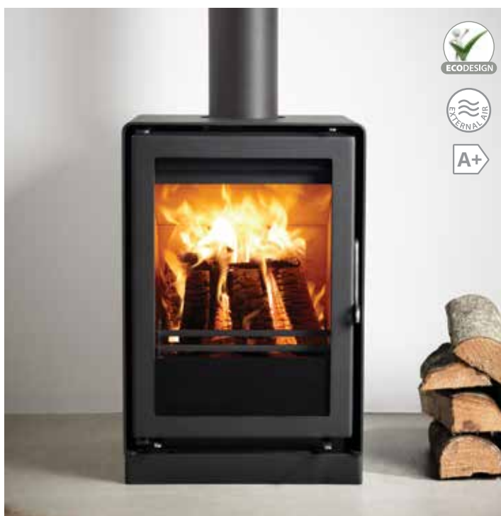
Uniq 35 freestanding