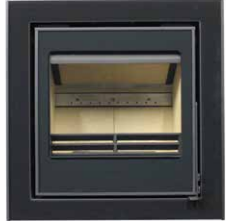
Glass Frame - Hidden Handle