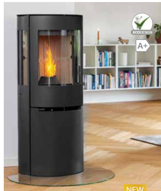
Aduro P5 Pellet Stove

Output 6.8 pellet/7kW wood Efficiency up to 87% pellet up to 81% wood* Fuel Wood* or Pellet Flue 150mm Weight 135Kg Size mm 1200H x 500W x 508D Wood pellet capacity 13kg