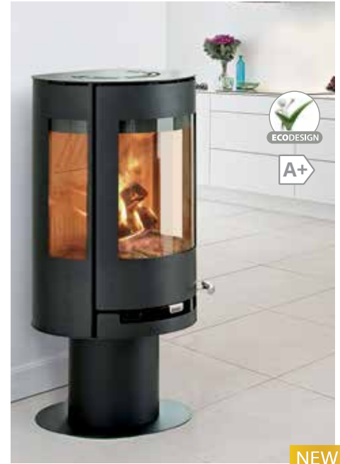
Aduro 9.3 Wood Burning Stove

Output 6.8 pellet/7kW wood Efficiency up to 87% pellet up to 81% wood* Fuel Wood* or Pellet Flue 150mm Weight 135Kg Size mm 1200H x 500W x 508D Wood pellet capacity 13kg