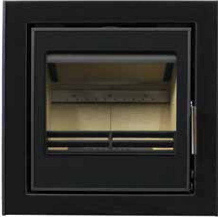
Glass Frame - Chrome Handle