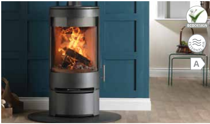
Purevision PVR Cylindrical Stove with low logstore

Output 5kW Efficiency 76.8% Fuel Multifuel Flue 127mm Weight 105Kg Size mm 994H x 465W x 465D