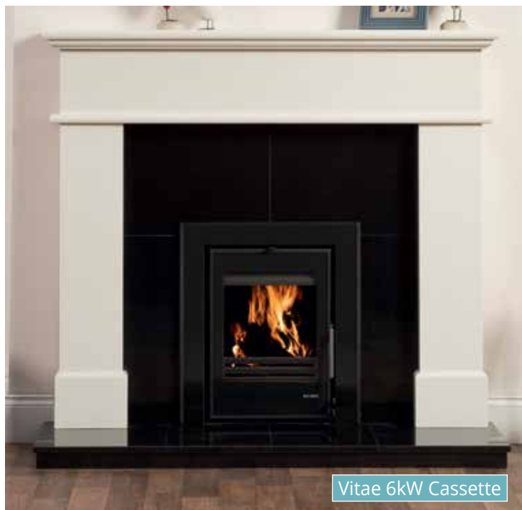
Vitae 6kW Cassette