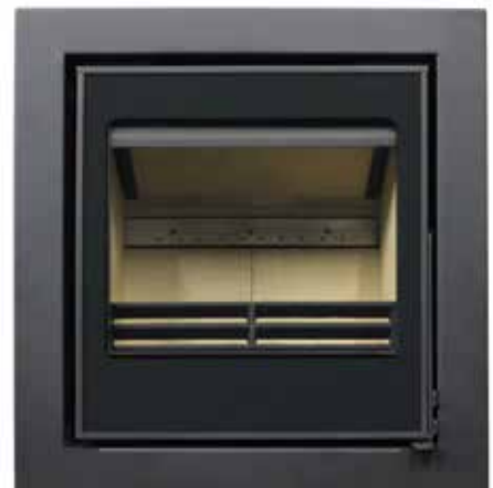
Steel Frame - Hidden Handle