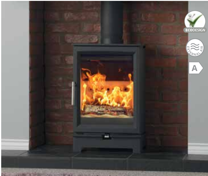
Woodtec 5 Stove on stand