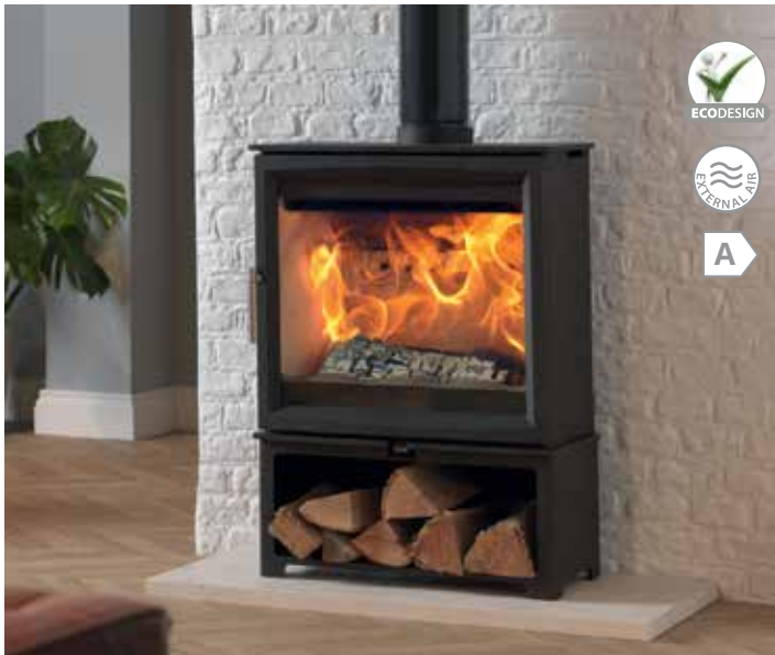
Woodtec 5 Extra Wide Stove on logstore

Also available with low leg stand or logstore