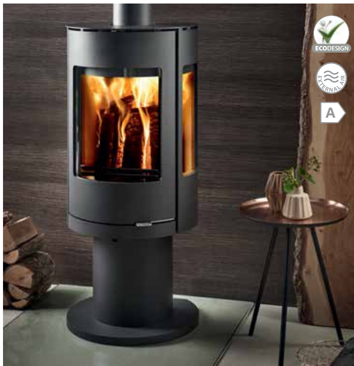
Uniq 37 Pedestal