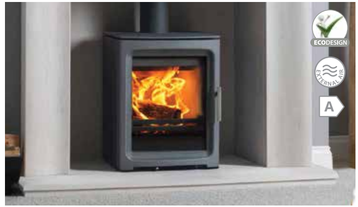
Purevision PV5 Stove (freestanding)

Also available with high logstore, low & high pedestal, wall-mounted